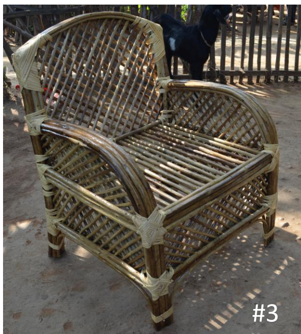
SINGLE SEAT SOFA