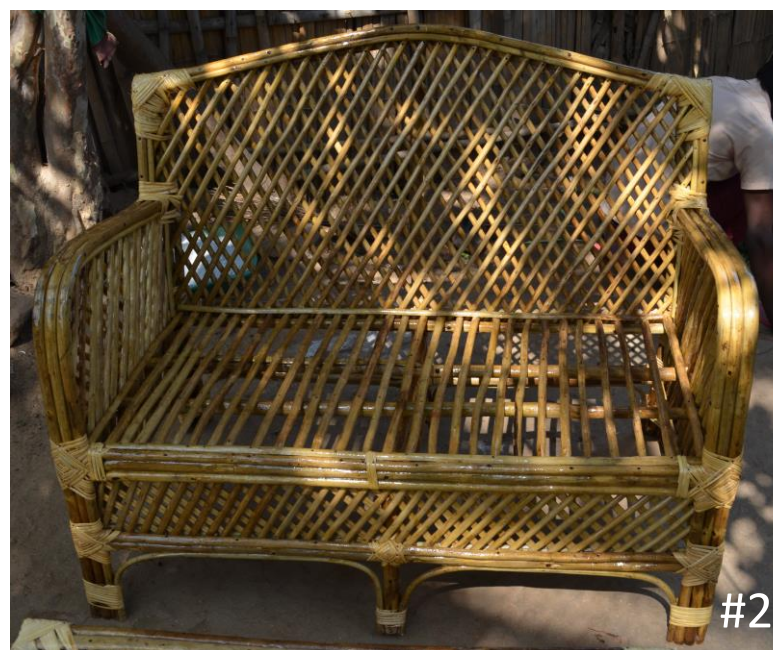
2 SEATER SOFA