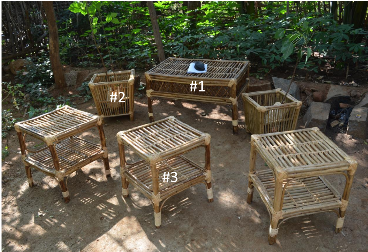
CLASSIC CENTRE TABLE