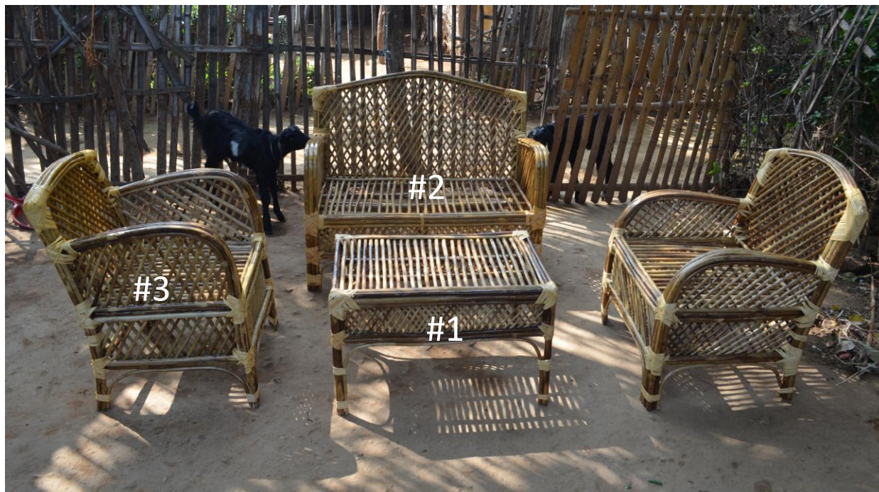
CLASSIC CENTRE TABLE